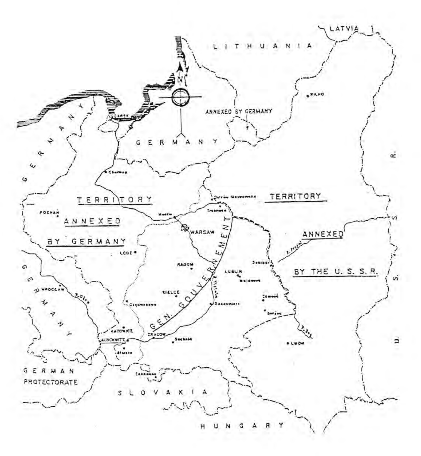
Figure 10: Map of Europe showing the General-Government area (Garlinski 1975:15)

parties. They very often exceeded the camp guards in cruelty.