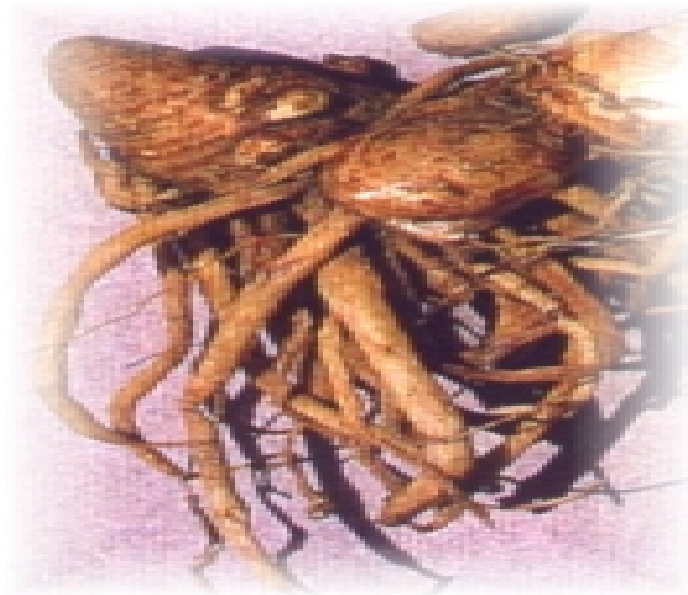
Fig. 1.2 Swollen tubers and the aromatic roots of wild ginger (van Wyk & Gericke, 2000).

Up to twenty swollen tubers may be attached to the rhizome, each connected by succulent roots (Fig. 1.2). The rhizome, which is coned-shaped and narrows to a tapering point, is dug up and sold (van Wyk & Gericke, 2000). Rhizomes harvested during the growing season will have roots on them. Those taken during the dormant season, when the plants are leafless, will have no roots on the tubers (van Wyk & Gericke, 2000).