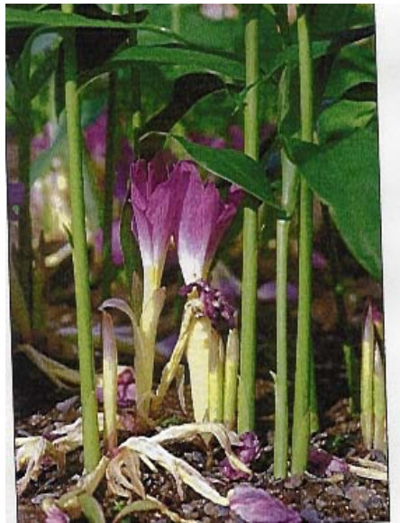
Fig. 1.1 The bright pink flowers of wild ginger (van Wyk & Gericke, 2000).

The wild ginger has tremendously attractive flowers, which are borne at ground level and are very short-lived (Fig. 1.1). Flowers often appear before the leaves in spring, perhaps to allow them to be more visible to pollinators (van Wyk & Gericke, 2000).