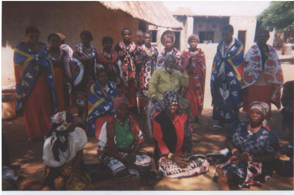
Fig. 2.1 Public meeting of traditional healers