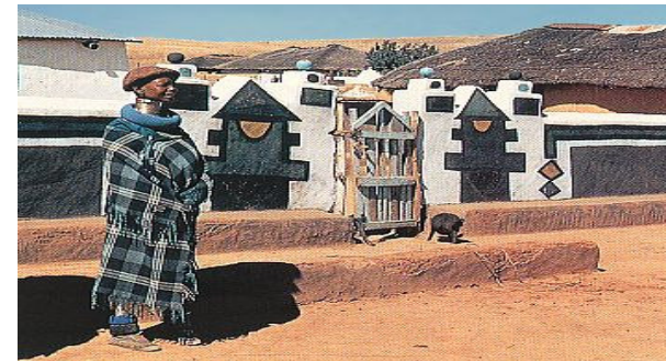
Fig.4: Mosaic on Ndebele traditional house ( http://www.museums.org.za ).

Architecture and art cannot become independent from one another because art and sculpture as well as other crafts are considered as enhancement to the buildings, all working together towards common expression rather than being masterpieces in themselves.