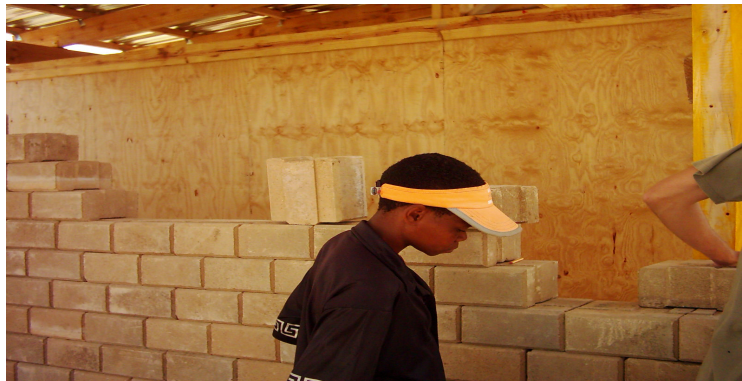
Fig.5: Building with stabilized interlocking adobe bricks, Orange farm, Johannesburg, South Africa (Photo by author, 6th April, 2005).

participation, such that using their skills in modern materials and skills will be an innovative way of improving the informal settlements.