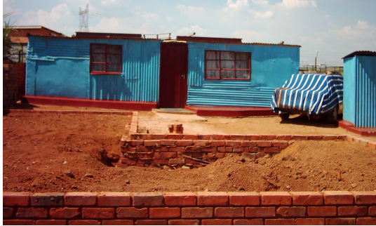
Fig.3: Subsidised house at floor level with a shack (informal housing) besides it, creating a slum in Mamelodi (Author).

The idea that beneficiaries will gradually improve their homes over time seems unlikely given the fact that almost all beneficiaries in the programme are unemployed or earn R1500 or less per month. Given the gradual rise of unemployment in the country the serviced site/ self-build programmes actually create slums and the subsidy spent in these programmes is merely dead capital.