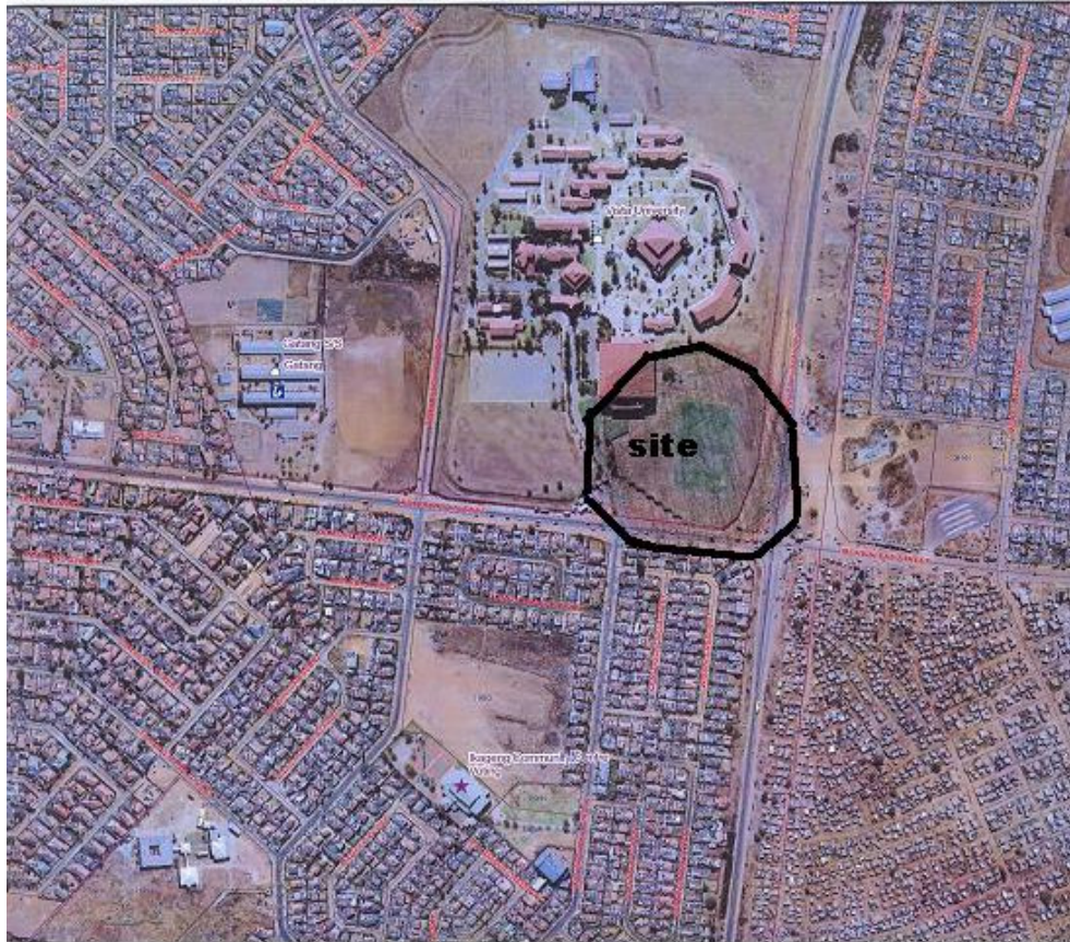
Fig.2: Aerial map of the site. (Tshwane Metropolitan Council, 1999).

The design discourse, the training and research development centre in the arts, crafts and building skills is a formal proposal for the site situated on the corner of Hans Strijdom Drive and Hinterland Drive Street, on the Mamelodi campus of University of Pretoria in Mamelodi precinct of Tshwane Metropolitan.