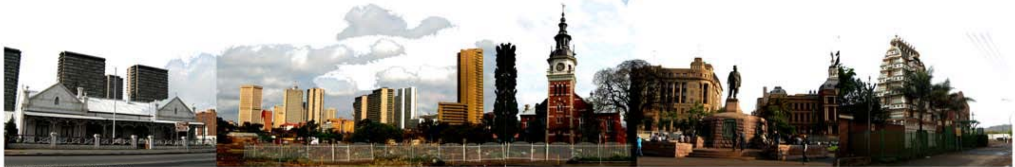
003 (IMAGE COLLAGE BY AUTHOR)