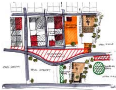
001 Site activities

This is especially true in an environment where the economic backing and systems are limited and scarce. This inclusion of the users of the design is a fundamental part of the proposed design. An attempt to encourage ownership with the long term output of appropriation. In this way, it attempts to set the stage for the growth, emergence and development of the proposed development. The proposed design also attempts through various ideologies and practises to redefine the proposed design and the built environment on site as a part of the process of enablement where the task of involvement consideration and understanding of the users and the current activities and systems become primary and influential in the proposed design.