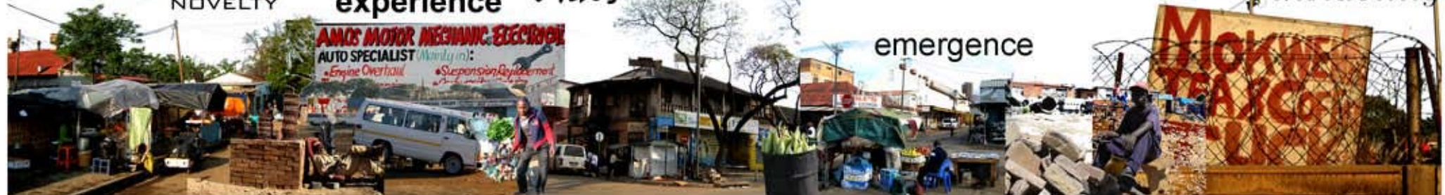
004 (IMAGE COLLAGE BY AUTHOR)