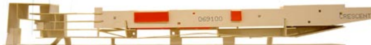
Concept model 01. Subtraction and addition on > 200m structure.

of the man-nature connection. The connection pertains solely to the systems that limit the impact of the built artifact on the environment. The man-nature connection per sé is not implied, because man and nature is not entities apart, but one and the same thing. The approach in 'connecting' 'man and nature' will therefore be the establishment of a building as a landscape.