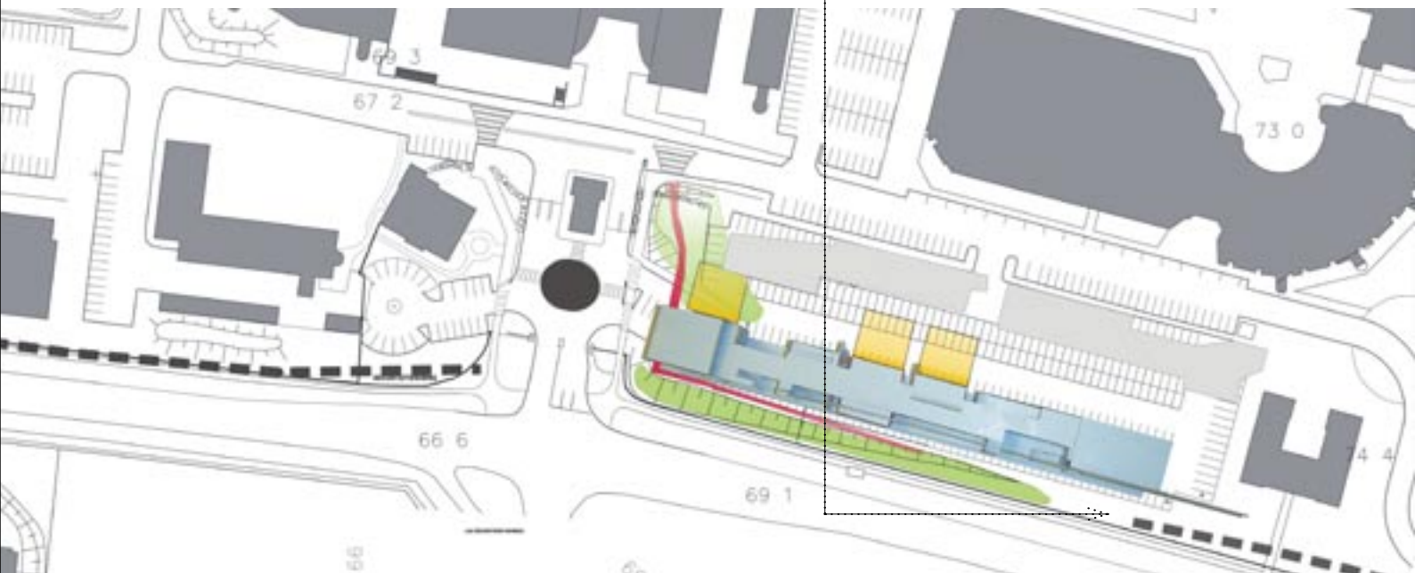
Concept model 01. Subtraction and addition on > 200m structure. Integrating the structure with the site to increase energy flow to and from the building.

Introducing a slipway for traffic moving in a west-east direction.