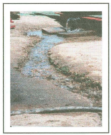
Frame 11 Artesian borehole drilled.

One core borehole was drilled at PHYS 20 next to percussion borehole H06-1054. The borehole was drilled to a depth of 149 metres after which the drilling equipment were flooded due to an intensive rain storm. The core was extracted with the wire-line method, measured and placed into core boxes. The core was inspected during drilling and notes were taken. However, only limited information was obtained due to the fact that most of the core was lost due to the sudden flood. The core was not