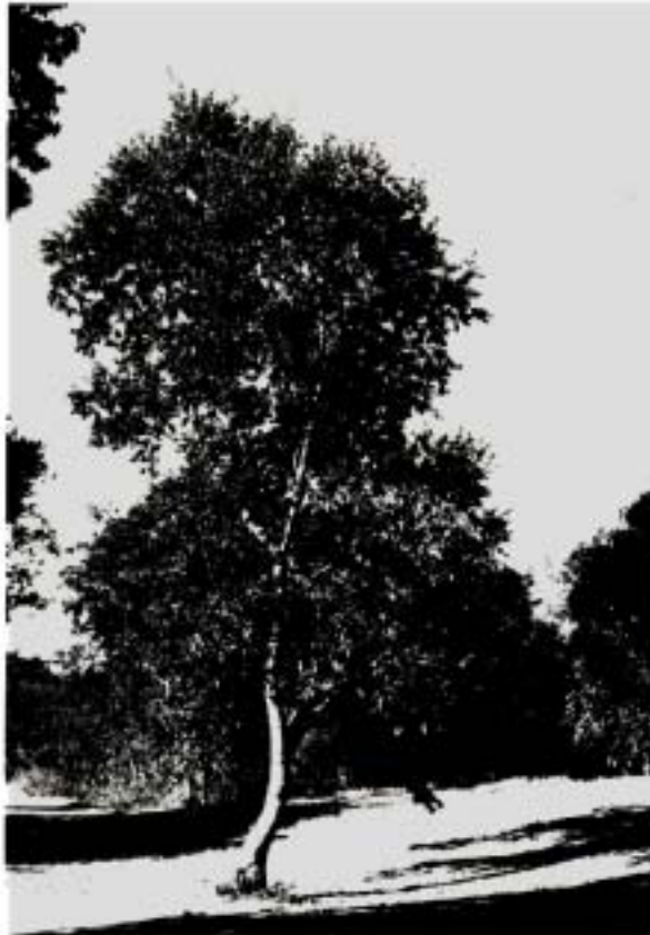
The more usual erect habit.