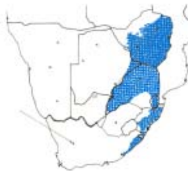
Figure 3.2: Common names and distribution of C. erythrophyllum [Adapted from Carr]

Transvaal: There are numerous records from most of the province, though none from south of the following places, from W to E: Zwart, Swartkrans, Komat, Krugersdorp, Loukop Dam, Waterval Ouder, Schagm, Barberton. Natal: In the coastal region from N to S limits, with westernmost records from Jans, Shongweni Pass, Ngobesa, Wemex, Lami River, Inqosi and Langobeni areas. Transkei and Eastern Cape: There are records from Cleydale district, Isakof's River, Ngobesa River, Kei Mouth and east of King