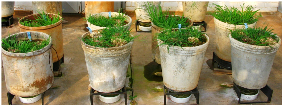
Figure 1: Greenhouse pot study on coal discard reclamation

A randomized study, using large pots, was conducted on the Hatfield Experimental Farm, Pretoria, South Africa (25°45'S 28°16'E), 1327m above sea level (Figure 1) in 2003, 2004 and 2005.