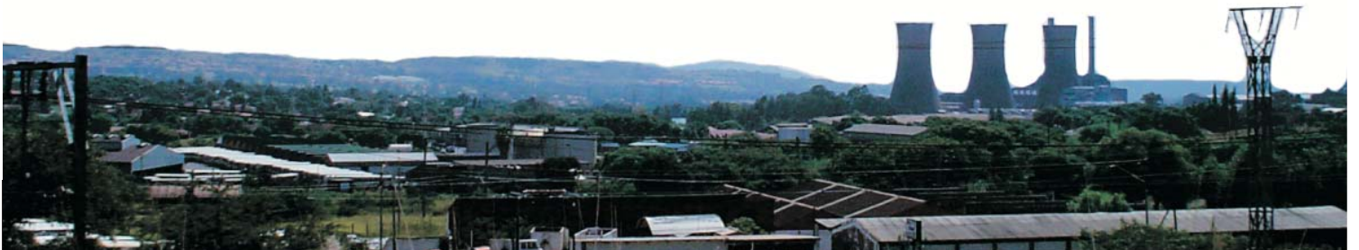
fig 2.3 skyline of Pretoria West

“A wave of verticals. Its agitation is momentarily arrested by vision. A gigantic mass is immobilized before our eyes” (de Certeau 1988:91).