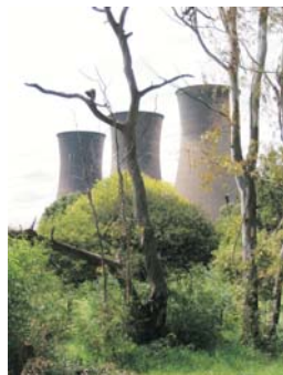
fig 2.2 Cooling towers viewed from Quagga road

The goal is to create a lively and dynamic environment which allows its participants to engage and interact with foreign objects found in the urban setting - such as the cooling towers of a coal fired power station - whilst providing opportunities for people to gather at the city edge.