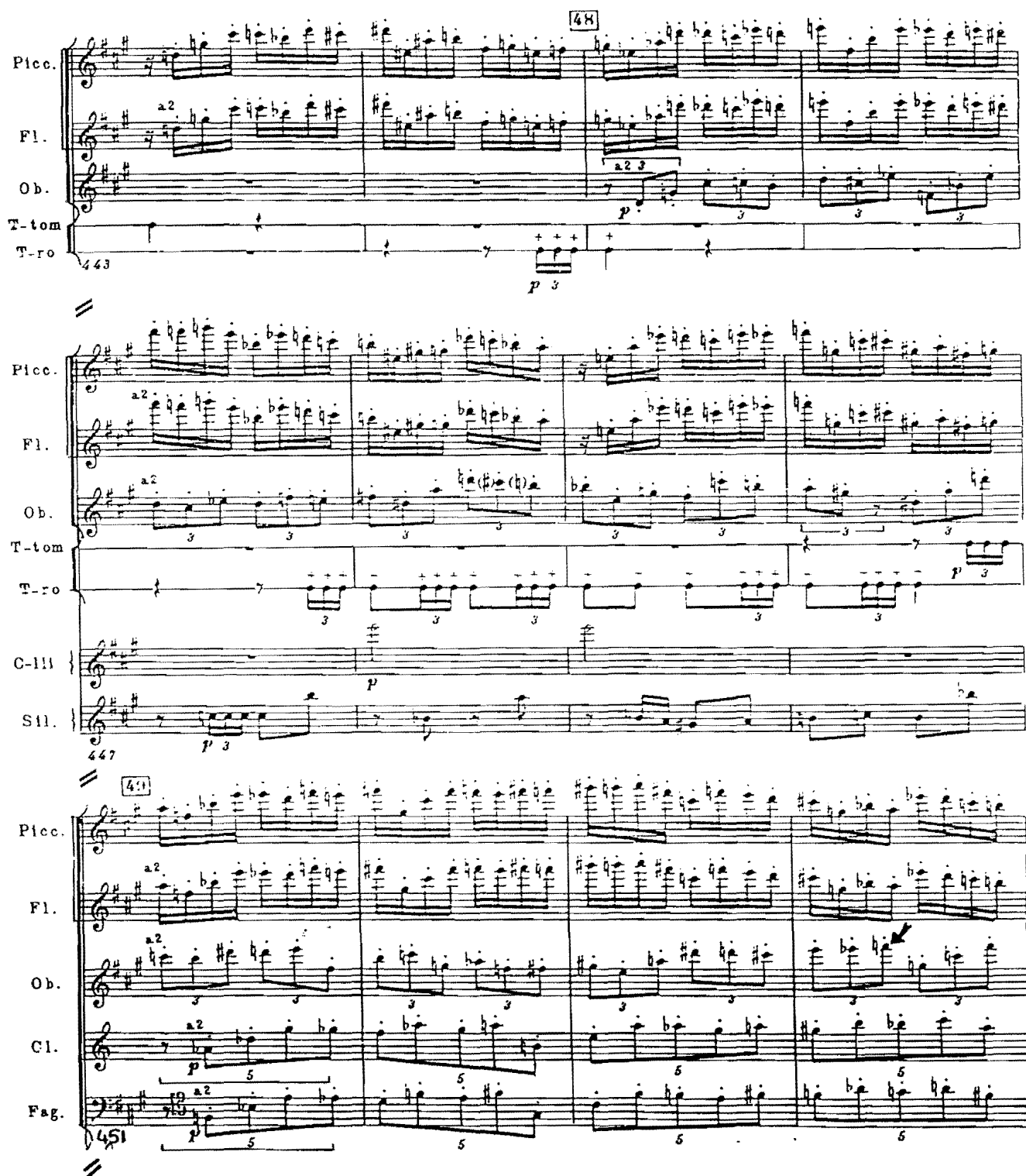
Example 7-6: Symphony No. 15, first movement, mm. 443-548

The final example of polyrhythm involving the oboes is found in the first movement of Symphony No. 15. The oboes are allocated staccato triplets against semiquavers from the piccolo and flutes and quintuplets from the clarinets and bassoon. Observe the high register scored for the oboes in mm. 454-455.