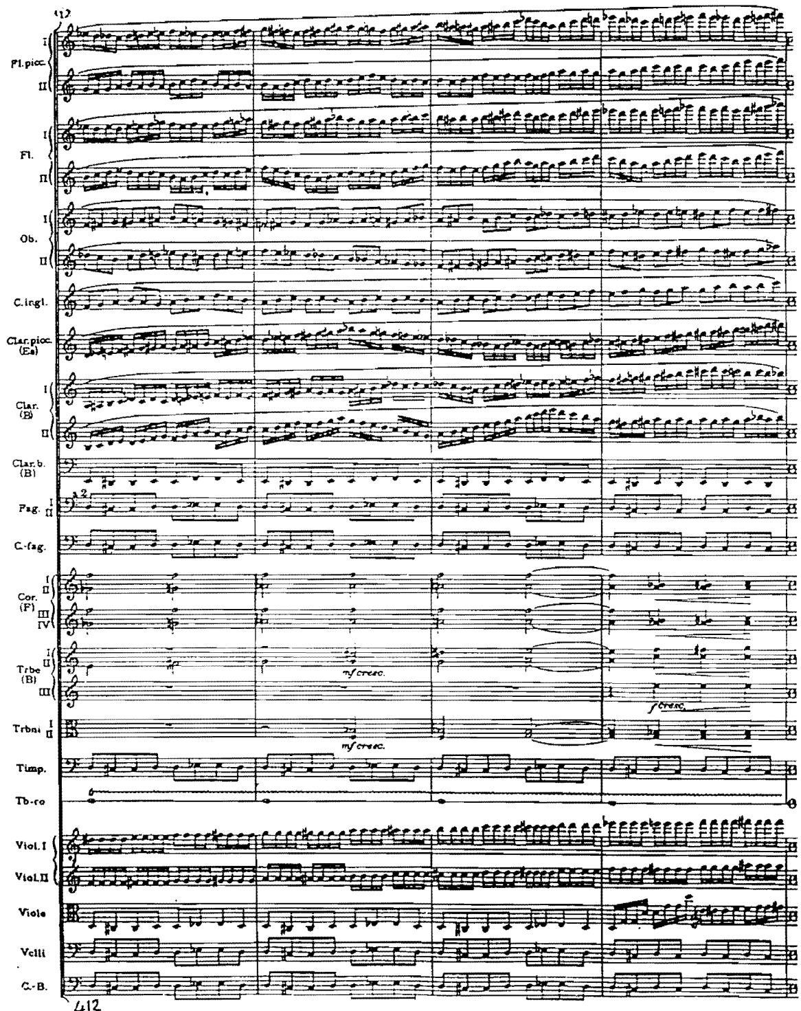
Example 7-4: Symphony No. 8, fifth movement, mm. 412-415

Toward the end of the fifth movement of Symphony No. 8 Shostakovich makes use of a variety of layered rhythmic material for the tutti. It is of significance that the three oboes and cor anglais are the only group dividing the beat into groups of triplets against four semiquavers played by the piccolo, flutes, E-flat clarinet, clarinets, first and second violins, while the bass clarinet, bassoons, contrabassoon, timpani, violas, cellos and double basses have a quaver rhythmic pattern and the brass a longer minim and crotchet figure.