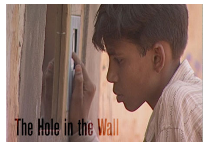
Figure 2.1: The "Hole-in-the-Wall" kiosk

A high-speed computer, connected to the Internet was placed in the wall separating their building from the slum area. Children were immediately attracted to the machine installed on their side of the wall (O'Connor, 2002). The children's interaction at the computer was monitored by a remote computer and a video camera, which was mounted in a tree close to the "Hole-in-the-Wall" kiosk (Judge, 2000). It was found that children were capable of teaching themselves to browse on the Net and to draw by means of the computer. They also learnt how to point and click, and by the end of the day children were browsing the Internet (O'Connor, 2002).