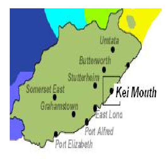
Figure 1.3: Location of Cwili in the Eastern Cape