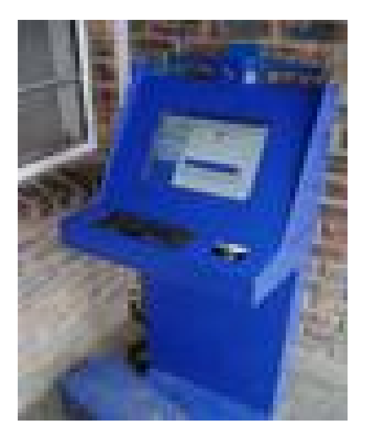
Figure 1.2: The blue metal machine

connectivity is provided by various mean, e.g. GPRS (http://www.digitaldoorway.org.za/index_main.php?do=hardware). Figure 1.2 illustrates the blue metal machine.