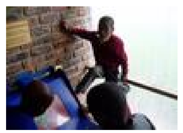
Figure 1.4: Cwili Digital Doorway

(http://www.senorjosh.com/archives/2003/12/digital_doorway.shtml).