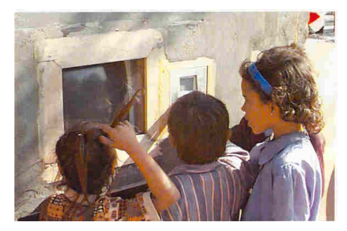
Figure 1.1: The Kalkaji experiment

According to Business Week (BW) online editor Peterson (2002:76), Mitra tested his ideas by taking a personal computer and connecting it to a high-speed data connection and imbedding it in a concrete wall next to NIIT's headquarters in the South end of New Delhi. The wall separates the company's grounds from a garbage-strewn empty lot used by the poor as a public bathroom. Mitra simply left the computer connected to the Internet and allowed any passerby to play with it. He monitored activity on the personal computer using a remote computer and a video camera mounted in a nearby tree. According to Mitra and Rana (2001:224), activities were monitored through the day and notes were taken.