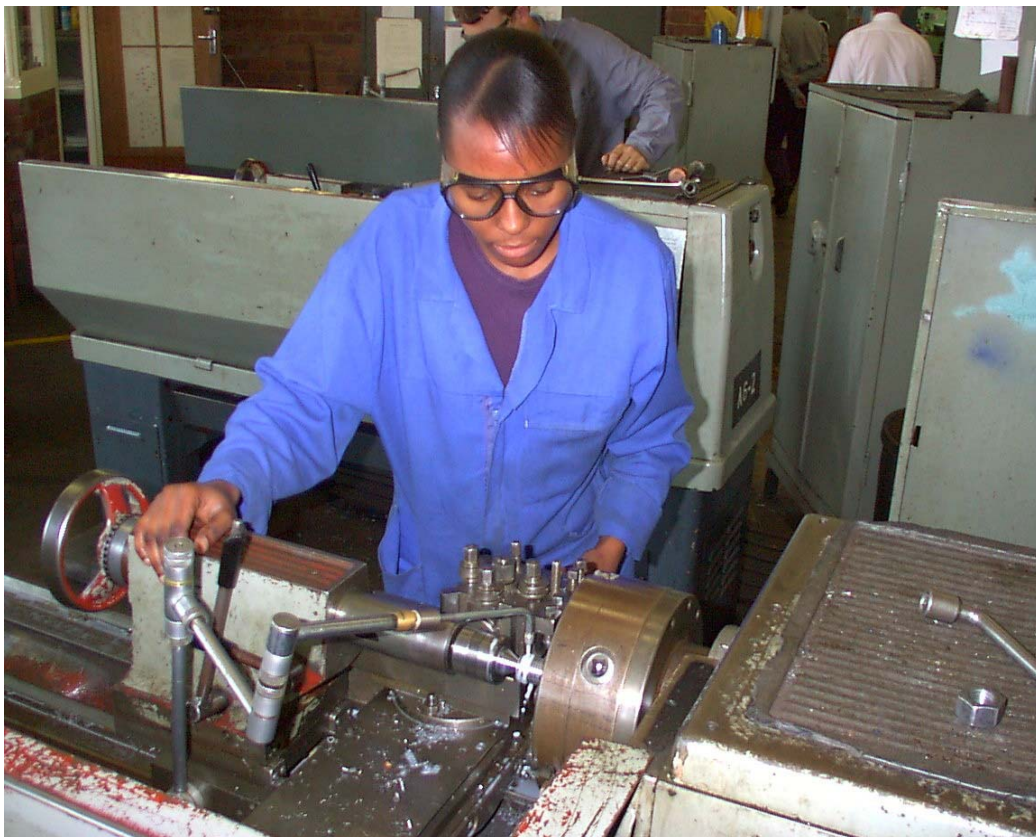
Photo 3: First lady to pass trade test as Electrician at the Pretoria West College of Engineering

The teaching and management staff comprises 100 members of whom 45 are African, 1 coloured, 1 Indian and 53 white 125 with 95 percent male and 4 percent female. The