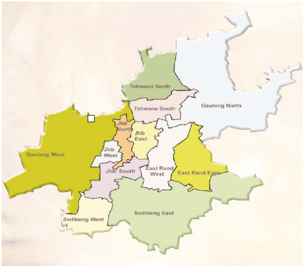
Map 2: The twelve education districts in the Gauteng province