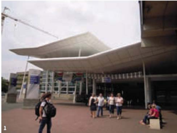
Gautrain Sandton station

Visitors arriving at our up-to-the-minute OR Tambo International Airport ought to feel at home in the new state-of-the-art Gautrain stations, complete with their stainless steel and white powder coated trimmings and tree-like roof structures. They offer a seamless continuation of the international travel experience and beckon the same choice and effervescent urban experience of "overseas" cities. Or do they?