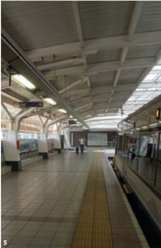
Gautrain OR Tambo Johannesburg

Whereas high-income earning executives can now choose to travel to work either in their Mercedes Benzes or on the Gautrain, while either talking on their I-Phones or e-mailing on their I-Pads, the other 99% of our society continue to experience the glass ceiling of immobility.