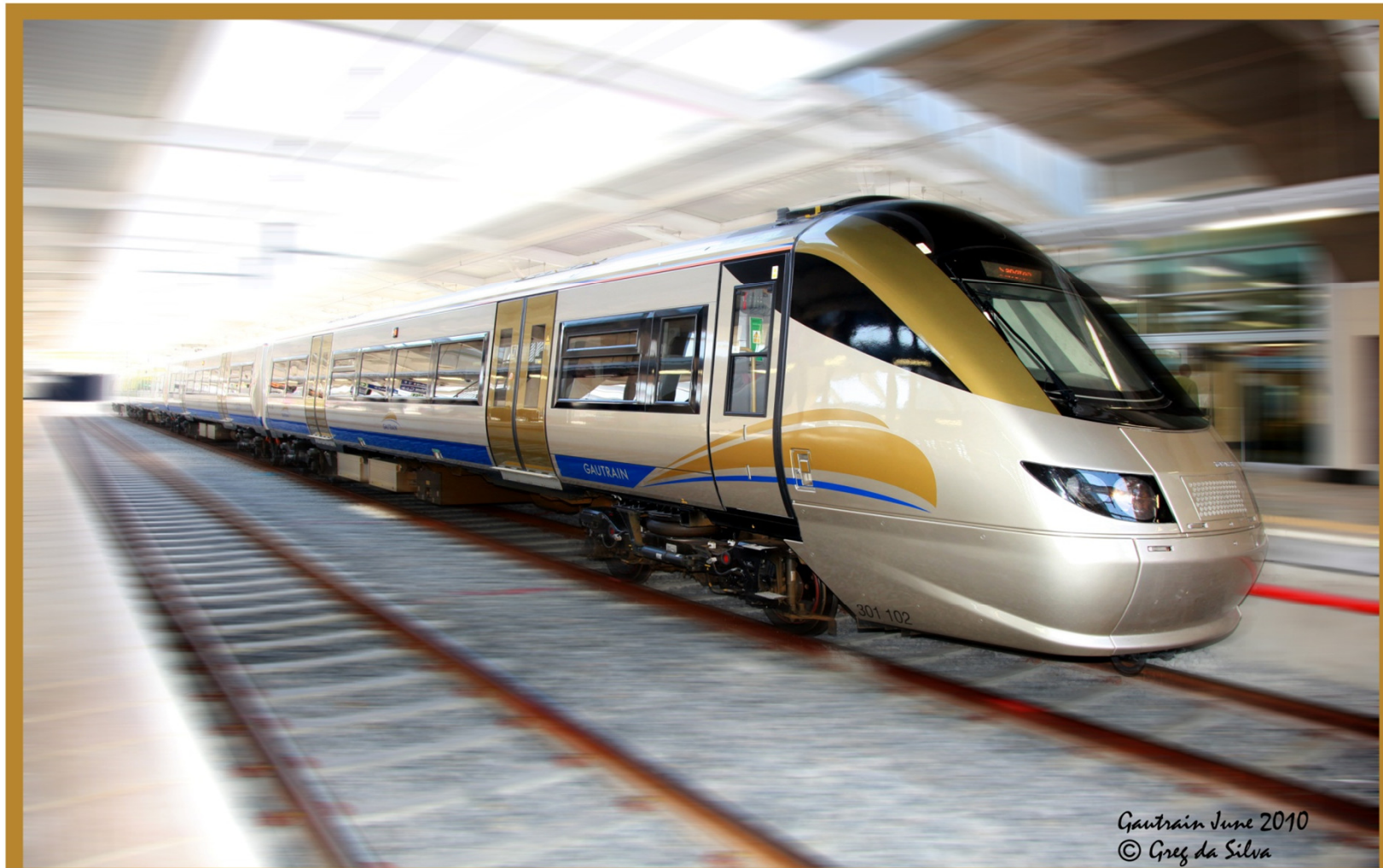
Gautrain June 2010