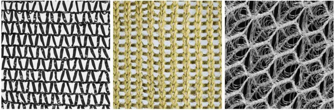
Figure 3: Three mesh types for fog collection. The Raschel mesh (35 % shading, left panel, www.marienberg.cl ) has been successfully applied for many years in 35 countries on 5 continents. It is used double layered in Standard Fog Collectors (SFC) and Large Fog Collectors (LFC) (only one layer is shown here). The middle panel shows a robust material with a stainless mesh, co-knitted with poly material ( http://www.meshconcepts.co.za ) that has been employed in South Africa. The right panel shows a newly proposed design of a three-dimensional net structure (1 cm thickness) of poly material ( http://www.itv-denkendorf.de ). Note that no overall comparison of mesh collection rates and technical performance has been conducted yet. The edge lengths of mesh sections shown are 6.5 cm.