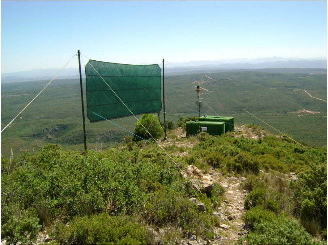
Figure 2: Image of the 18 m 2 flat-panel fog collector located at Mount Machos (Valencia region, Spain), together with the water tanks.