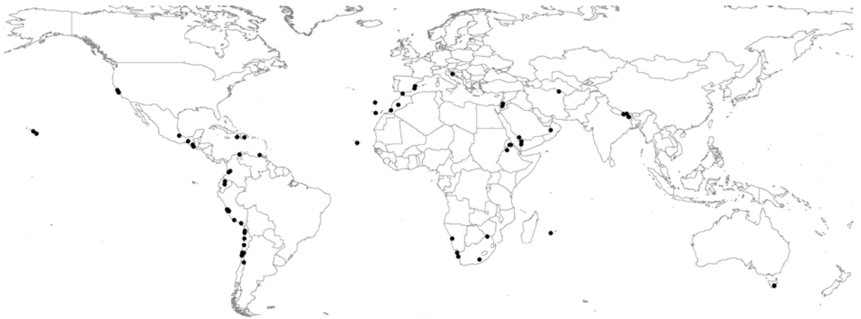
Figure 1: Map with locations marked that were successful, are successful, or bear the potential for being successful in collecting fog for the production of fresh water in arid or seasonally arid regions. The potential must have been proven by an evaluation project.