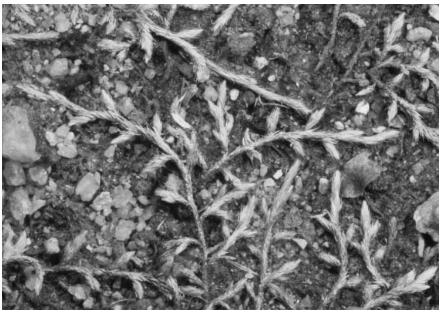
FIGURE 29.— Selaginella nivea with short, club-shaped terminal branches.

Selaginella nivea is under-collected and often misidentified, given its superficial resemblance to the much more common and widespread S. dregei . However, its habitat does not overlap with the other regional