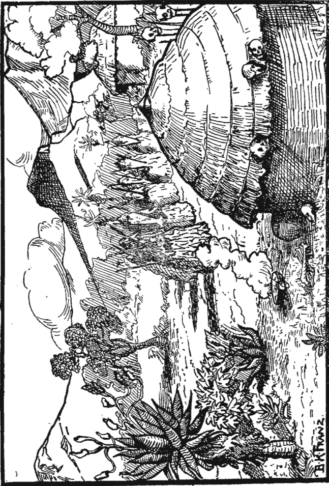
Now a remarkable procession issued from the kraal.