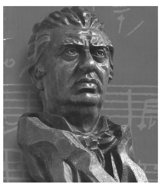
Figure 9 Bust of Khachaturyan in the foyer of the Aram Khachaturyan Concert Hall (Aram Khachaturyan Museum brochure).

Another, and in this case, very realistic bust of Khachaturyan can be found in the foyer of the Aram Khachaturyan Concert Hall.