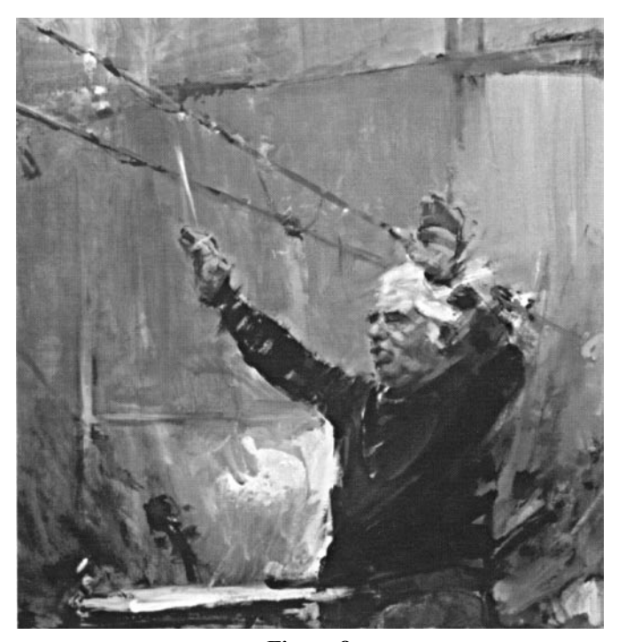
Figure 8 The painting of Khachaturyan by Edman Alvazyan.

A painting of Khachaturyan by Edman Alvazyan, painted in 1977, can be found in the Aram Khachaturyan Musum. It was given to the museum by Catholicos Vazgen 1 in 1984.