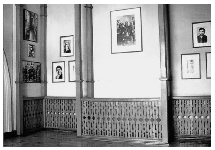
Figure 3 Interior of the Museum (photograph: Aram Khachaturyan Museum brochure).

Khachaturyan's dream has come true. The illumination is a remarkable feature of the interior of the Museum. The building is constructed in such a way that light fills every corner of the two top floors and penetrates the concert hall from two sides. Illumination is reduced only in the rooms of the ground floor. The exposition of the Museum is on the third floor. This is a suite of spacious halls where the valuable exhibits are housed.