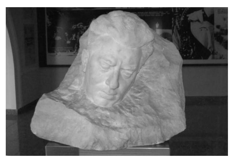
Figure 7 The bust of Khachaturyan by Nikogesyan.

Inside the Aram Khachaturyan museum there is a marble bust of Khachaturyan by Nikolay Nikogesyan (b. 1918). This bust strongly resembles a bust of Komitas,<sup>4</sup> in the National Gallery of Yerevan, that might also be by Nikogesyan. It also resembles the marble bust of Gustav Mahler by the French sculptor, Auguste Rodin, in the Rodin museum in Paris.