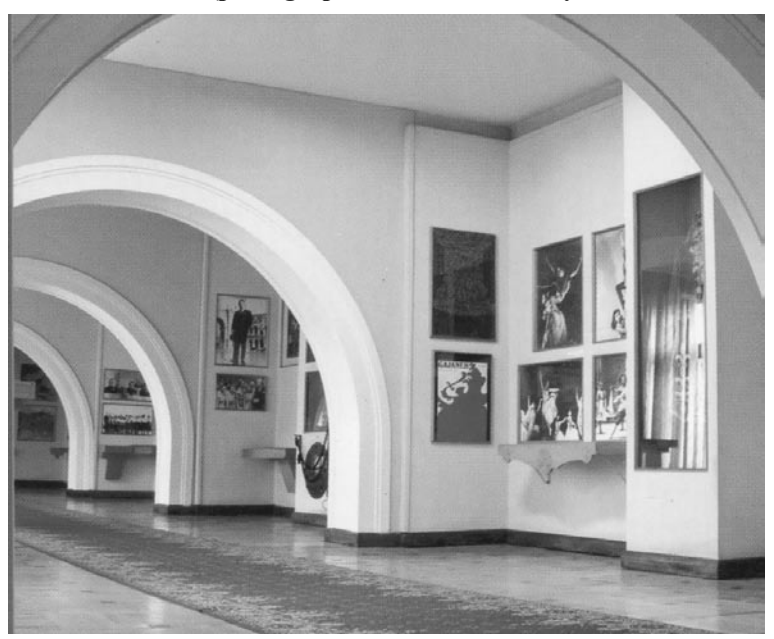
\label{eq:Figure 4} Figure \, 4 Interior of the Museum.

A park has been laid out on the top of the Tsitsernakaberd elevation with the memorial complex to the victims of the 1915 genocide in its centre. Twelve massive basalt pylons slope to form a mausoleum. In the centre of the mausoleum is a depression with a large chased copper bowl in which a perpetual flame burns. The music of the Armenian composers Komitas and Khachaturyan can always be heard here.