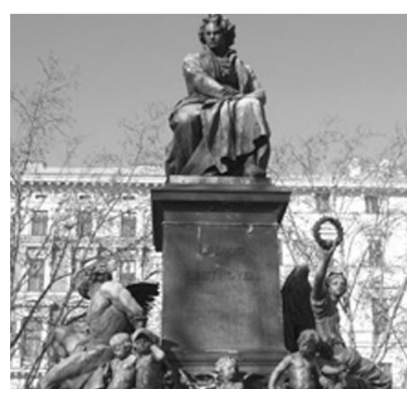
Figure 6 Beethoven statue, Vienna, by Von Zumbush.