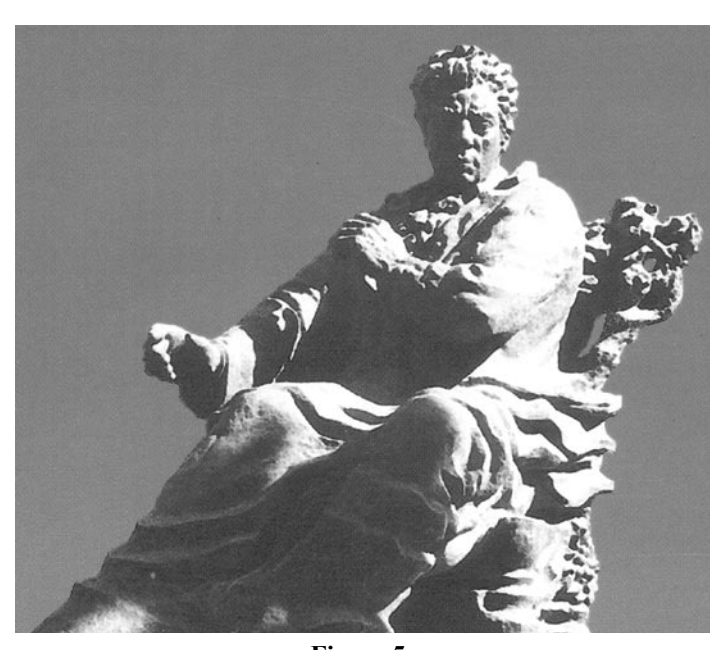
Figure 5 Khachaturyan statue, Yerevan, by Petrossyan.

This seated statue shows a marked similarity to the seated statue of Beethoven in the Beethovenplatz near the Konserthaus in Vienna, created by Casper Clemens von Zumbush and unveiled on May 1, 1880. Both statues show the composers in a thoughtful mood, looking slightly downwards, Beethoven with his head turned to the left, Khachaturyan to the right. Both are wearing long flowing garments with collars and long sleeves, the folds arranged over their knees. Both are on high square pedestals, although that of Beethoven is embellished, that of Khachaturyan unembellished. The 20<sup>th</sup> century Khachaturyan statue is therefore still very much in the 19<sup>th</sup> century tradition of realist statues of composers. (See Steyn 2004:143-54).