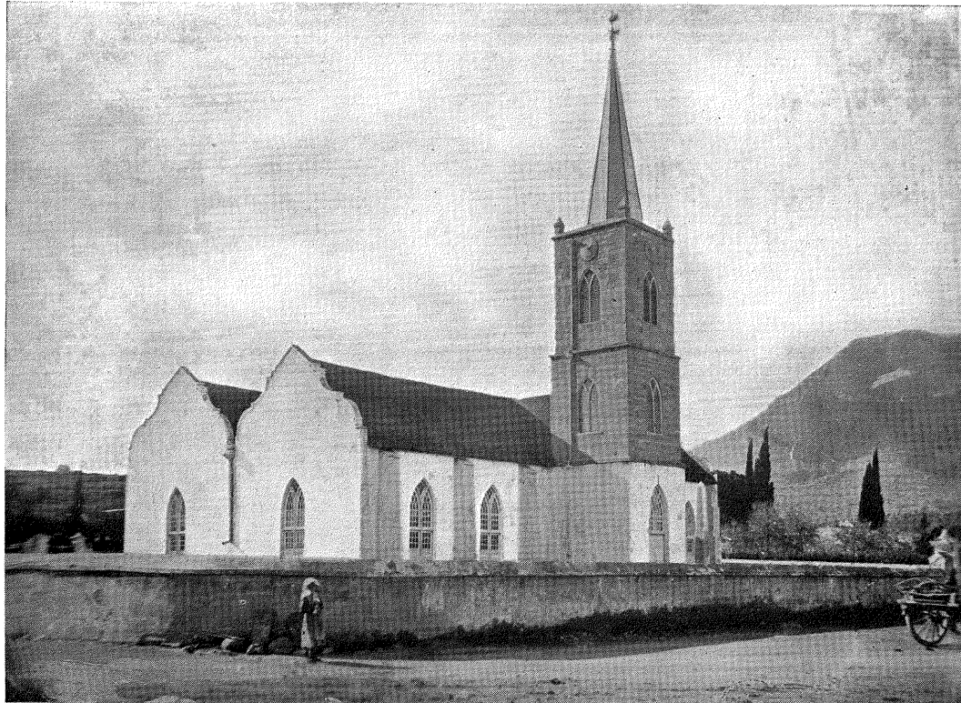
THE OLD CHURCH.