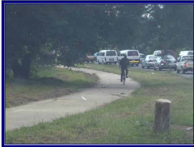
Photo 1: Moses Mabhida Road