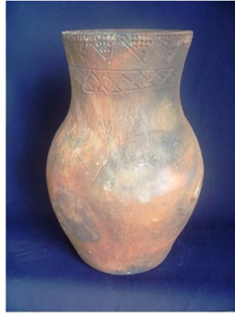
Alice Qga Nongebeza vessel, 360mmh x 240mmw x 183mm lip Ø; (photo 2008).