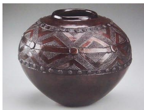
Figure 11 Buzephi Khanyile Magwaza vessel, 2006, 22.2 cm x 25.4 cm (Perrill 2008: 43).

It is time to take, amongst others, Elizabeth Perrill’s (2008) example and drop usage of “craft” from southern African visual arts contexts, thereby encouraging a greater degree of flexibility for changes in mindset, underpinned nonetheless by recognition that in any event individuals, societies, and purchasers of artworks will apply own enjoyment, investment, use value, and aesthetic criteria.