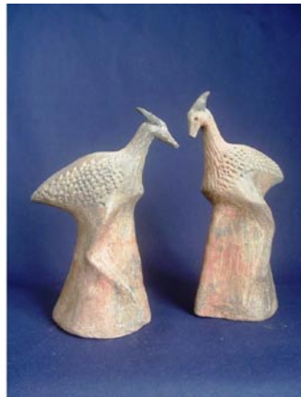
Figure 6 Alice Qga Nongebeza birds, 220mmh x 140mmw each, (photo 2008).