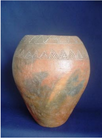
Alice Qga Nongebeza vessel, 330mmh x 289mmw x 173mm lip Ø; (photo 2008).