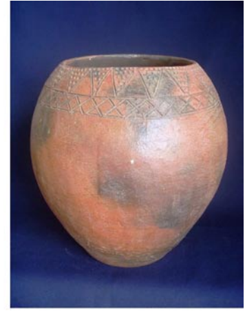
Alice Qga Nongebeza vessel, 306mmh x 294mmw x 184mm lip Ø; (photo 2008).