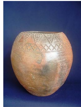
Alice Qga Nongebeza vessel, 241mmh x 240mmw x 146mm lip (photo 2008).