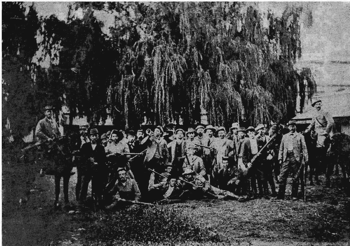
Die Duitse Vrywilligerskorps, Pretoria 1895. Die foto is net na die Jamesoninval geneem. The German corps, 1895. The corps was founded in Pretoria after the Jameson raid.