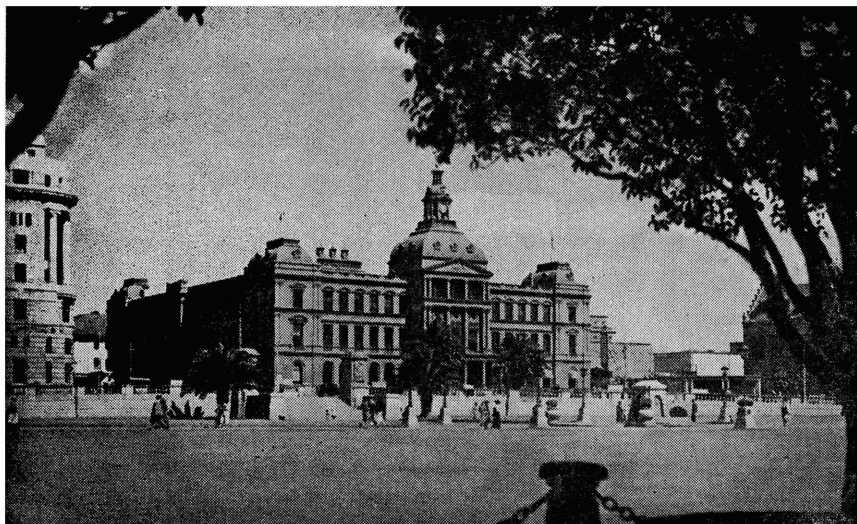
Kerkplein. Die ou Raadsaal ongeveer 1919. Church Square. The old Government building, circa 1919.