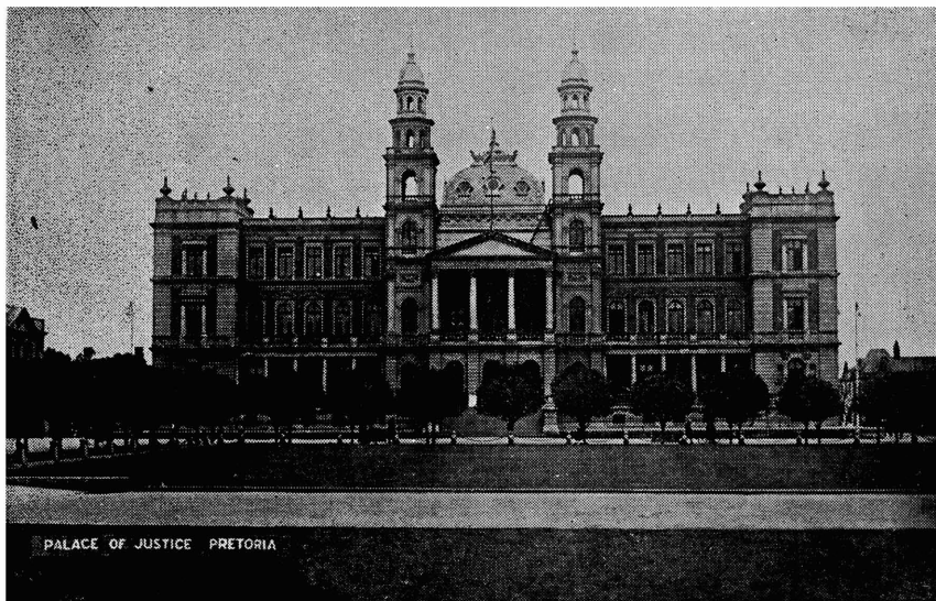
Kerkplein. Die Paleis van Justisie ongeveer 1919. Church Square. The Palace of Justice, circa 1919.