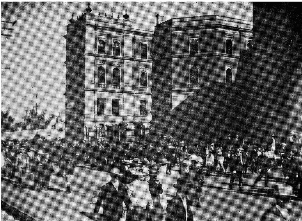
On the 16th of December, 1904, Paul Kruger, who died in exile, was buried in Pretoria. Photo shows old artillery men who acted as guard of honour during the burial procession.

Foto van begrafnisstoet van Paul Kruger op 16 Desember 1904.