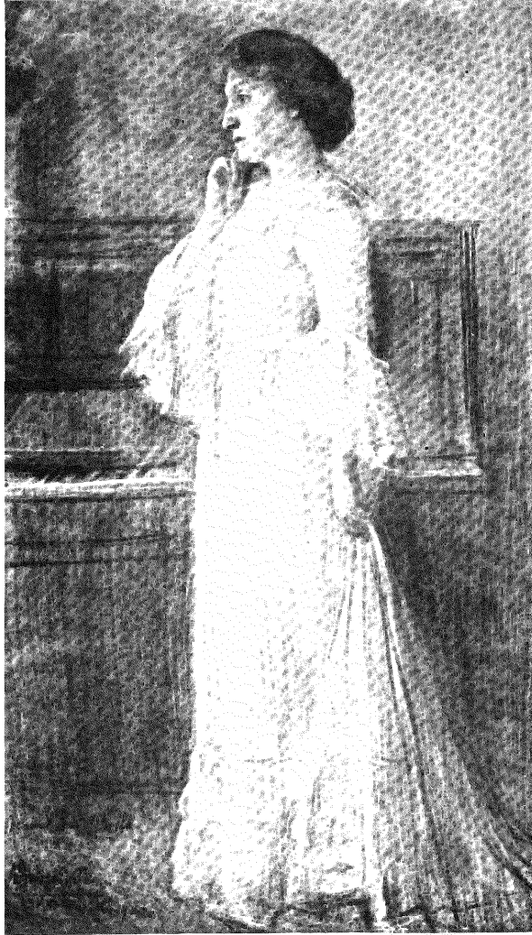
Mrs. Botha in 1902