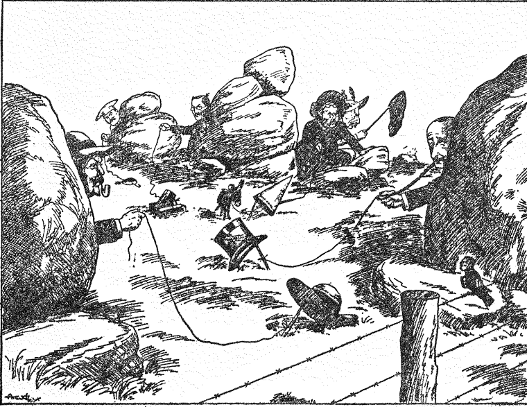
THE TRANSVAAL ELECTION OF 1907

The Assembly elections of March 1907 provided a sensation. Het Volk won thirty-seven out of sixty-seven seats, and therefore had an absolute majority. The Pro-