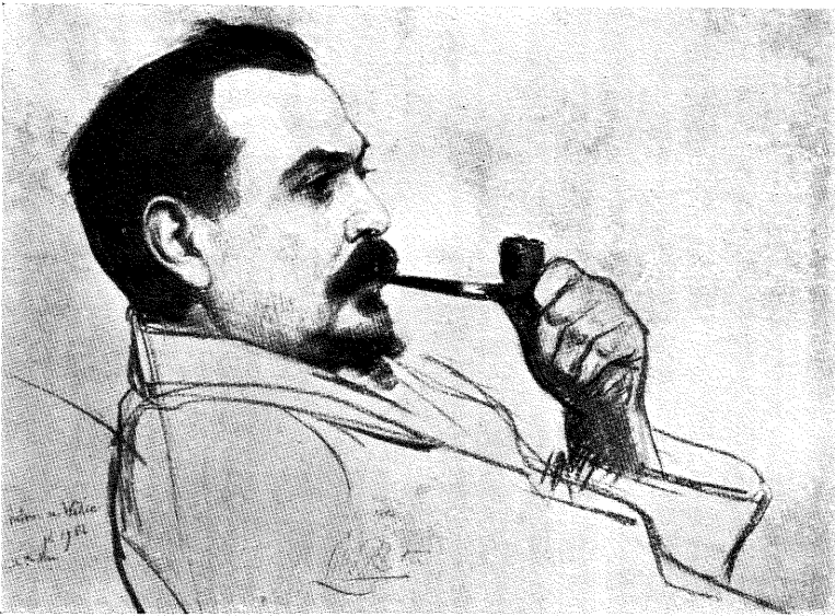
LOUIS BOTHA IN 1902