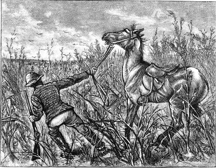
STALKING UNDER DIFFICULTIES.