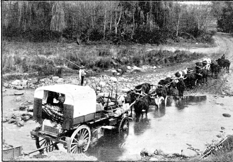
A BOER TREKING.