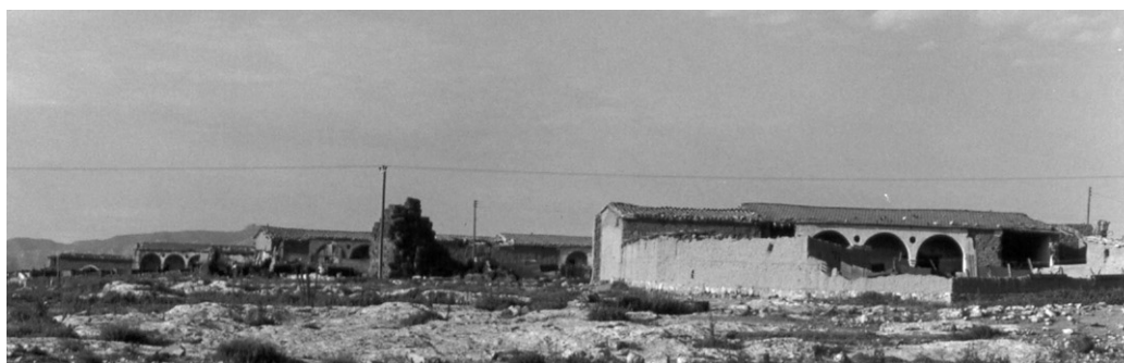
Figure 4: Modular pattern of the Cypriot rural vernacular house

The modular growth in the space organization appears to be a flexible feature in the adaptation of these houses, according to the needs of multi use accommodation. The original three to five modules growth in the house can be expanded according to changing needs, taking into consideration the modular growth. The differences to the dimensions of existing volumes of space provide the opportunity to adapt to different needs in terms of accommodating tourism.