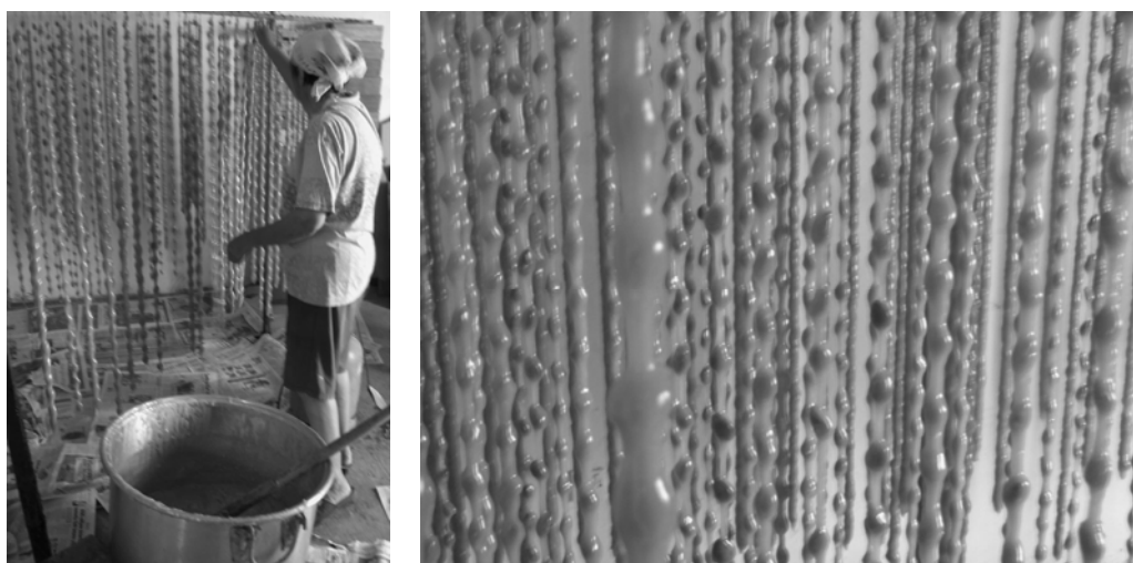
Figure 2: The production and drying process of “sucuk”- local grape product

On the other hand, some activities are continuously carried out in the household throughout the year. Bread cooking in the earth ovens, and local cheese and grape products processing outdoors, are the major activities that are possible to produce independently in the rural house. Even a daily series of activities related to the oven which is located on the front garden of the house, can be considered as a ceremonial activity by itself. Baking fresh bread, preparing various oven cooked dishes including desserts mostly end up with a great dinner table in the garden during the night time which turns out to be an inner house festival, sometimes joined in by the neighbours and other relatives. One of the many other household products, the production of “sucuk” thickened grape juice sweet with walnut/almond core lined on a string, is a traditionally unique fest on its own. The production and drying process of “sucuk” provides visual feasts with the huge spherical cauldrons, vertical linearity of the hanged products and the movement of family members circling around. The gathering of elderly and very young female members of the village to produce the handmade embroidery, which is very special for Cyprus, is also a social phenomenon which might be open to the contribution of tourists. These and similar traditions may provide attraction points for rural/ cultural tourism in an agrarian society.