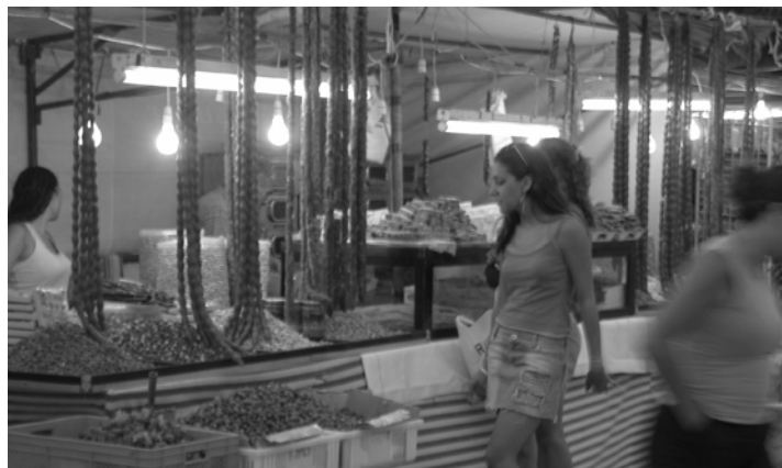
Figure 1: Annual Grape Festival in Galatia (Mehmetcik) Village

Although some activities of the rural life are performed within the household, they also bear ceremonial/ritual characteristics that are always shared by the rural community. Besides the potential of active participation of tourists in these production processes, they also bear opportunities for experiencing such unique social events within the rural society. The mutual interaction between rural society and ecotourists within the framework of production enriches the mode of tourism in the island. Furthermore, this approach ensures the continuity of these rural traditions. Cereal and grape harvesting, olive and carob collecting can be considered as the most important collective activities in the rural life of Cyprus. These activities are usually concluded with seasonal local fests which are very important in Cypriot rural life.