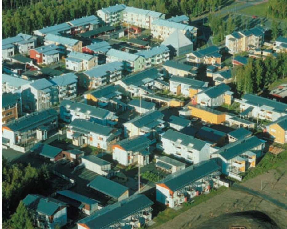
Figure 5. The nation-wide Modern Wooden Town project's first implementation was in Oulu. Altogether 45 2 – 3-story timber apartment buildings with a total floor area of 25,000 m 2 were constructed in the Puu-Linnanmaa construction area in 1998 – 2002. The area has 308 apartments and around 450 residents. The residential area was awarded Finland's 2003 Wood Award. University of Oulu, Department of Architecture, Wood Studio.

the wood milieu projects extends from wooden house neighbourhoods in rural municipalities to efficient town-like multi-storey timber apartment building milieus. In addition to the sites that are already built, under construction or in the planning stage, about twenty other municipalities or towns are considering wood milieu projects based on the goals of the Modern Wooden Town project. The completed wood milieu sites have received mostly positive feedback from residents, visitors and the media. Interest in the project is constantly growing.