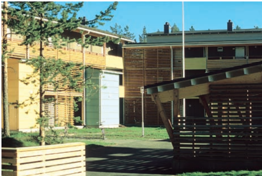
Figure 4. This wooden multi-storey residential building in Oulu is an experimental project (1995 – 1997) designed and developed by the Wood Studio under the auspices of the Department of Architecture of the University of Oulu.

Nowadays Finland is one of Europe's most multi-storey apartment building-intensive countries: 44 % of Finland's 2.5 million housing units are situated in multi-storey apartment buildings. The use of wood in over-two-storey buildings has been restricted by Finland's building and fire codes since the 1800s. Prompted by membership in the EU, Finland's fire code was modified on Sep. 1, 1997, after which it has been permissible to also construct 3 and 4-storey timber-framed residential and commercial buildings with a wood façade. In light of housing statistics, Finnish multi-storey timber apartment buildings have considerable potential to increase their share of the market, as three-quarters of Finland's multi-storey apartment buildings have less than five storeys, which according to current regulations means they could be made from wood – if so desired.