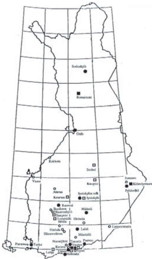
Figure 6. Modern wooden town partial projects in Finland.