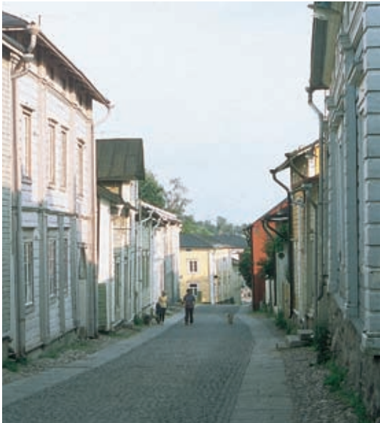
Figure 2. Old Finnish wooden town, Porvoo.

The development of Finnish wooden towns is considered to have ended at the end of the 1800s, since from then on no new wooden towns were established in the traditional sense in Finland. Likewise, the general development of buildings and rectangular town plans also ended. At about the same time wooden buildings began to be replaced with multi-storey stone buildings. This was supplemented with an open town structure in line with the functionalistic trend which became popular during the 1930s, which dealt the final blow to the wooden town based on closed streetscapes and yards. However, a few wooden town neighbourhoods were still constructed at the edges of towns during both the period of Scandinavian classicism (in the 1920s) and the so-called reconstruction period (in the 1940s and 1950s) after Finland's last wars. The Finnish multi-storey stone town building was developed in 1860 – 1900, and the stone town replaced the wooden town because it was more efficient. What's more, a strong depopulation of the countryside began in Finland in the 1950s, followed by urbanisation and neighbourhood construction. Extensive development of concrete technology in towns and multi-storey apartment building construction began in the beginning of the 1960s, after which timber construction had to make way for large-scale construction.