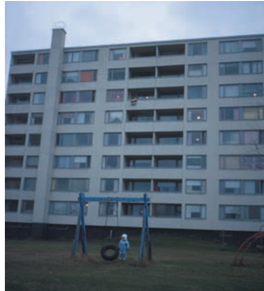
Figure 3. Typical Finnish concrete multi-story residential building from the early 1970s.