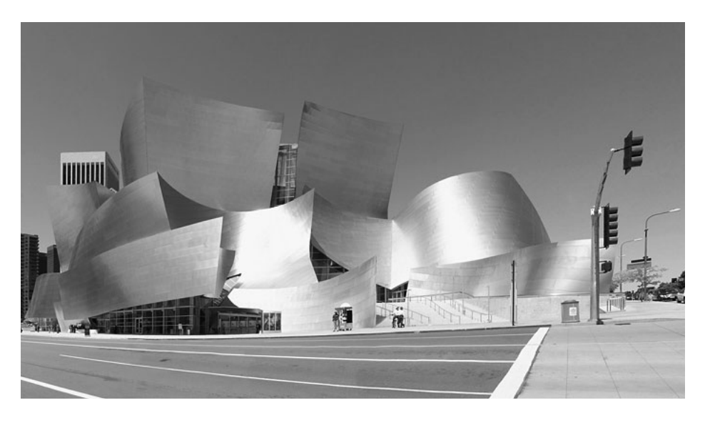
Figure 1 Elevation of the Walt Disney Concert Hall with part of the skyscrapers of downtown Los Angeles in the background.

composed of convex and concave undulating surfaces.<sup>1</sup> The concert hall is one of the architectural masterpieces of Frank O. Gehry, and is in many ways similar to his design of the Guggenheim Museum in Bilbao, Spain. The design of the Los Angeles theatre complex predates that of the Guggenheim Museum, but construction took place only after completion of the Bilbao project. Marked changes to and influences on the original design of the theatre complex are noticeable, clearly arising from knowledge and insights gained during the museum project.