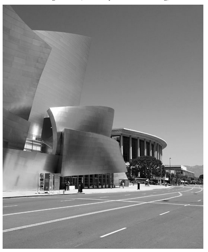
Figure 2 Part of Walt Disney Concert Hall with the Music Center and its columns across the street.