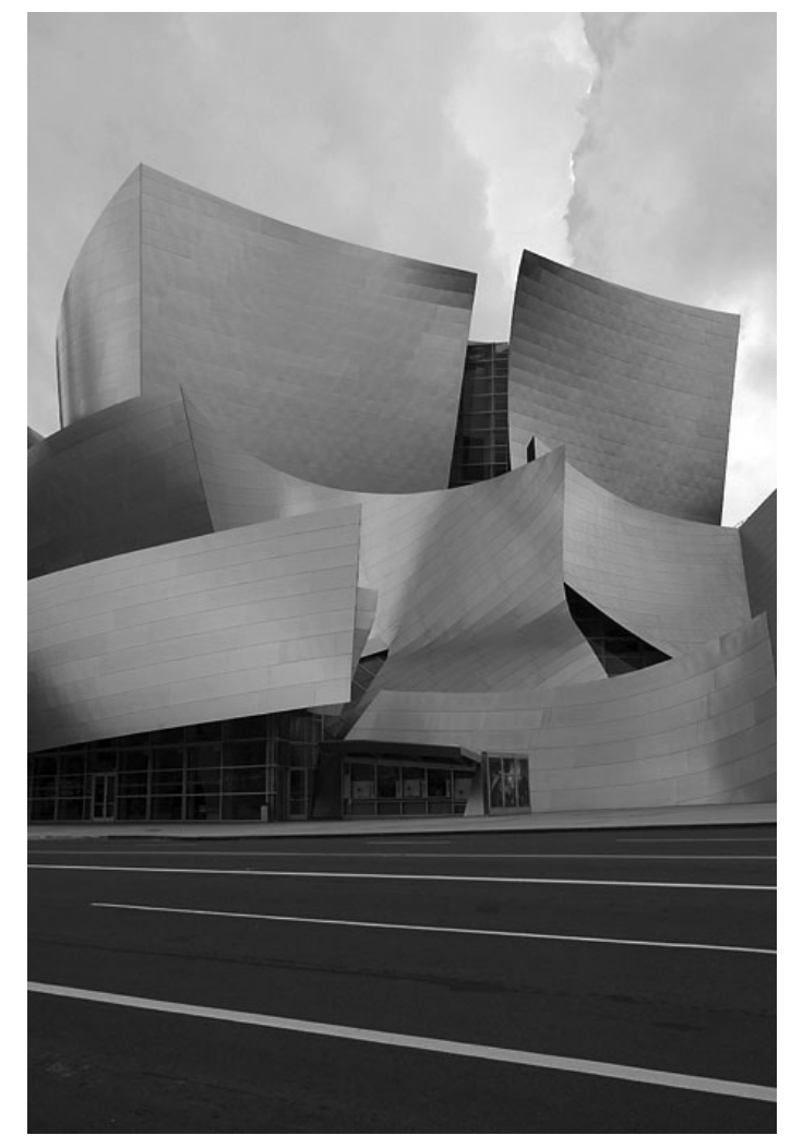
Figure 4 Frontal view including part of Grand Avenue linking The Museum of Contemporary Art (MOCA) further down the street