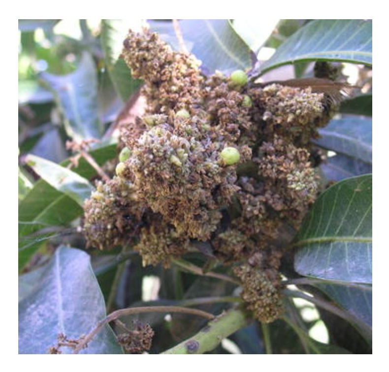
Fig. 1 Malformed inflorescence of mango collected at Sohar in the Sultanate of Oman

Samples of malformed inflorescences were collected from infected trees and surfacesterilized by submerging pieces of plant tissue in a sodium hypochlorite (1%) solution and then in 70% ethanol for 1 min each. Samples were then rinsed in sterile distilled water and dried on sterile filter paper before plating small flower pieces onto 39 g \Gamma^1 potato dextrose agar (PDA, Biolab, Merck). Following incubation at 25°C for 7 days, pure fungal cultures were obtained by single conidial spore transfers onto 20 g \Gamma^1 PDA medium. All isolates are stored and maintained in the Fusarium collection of the Tree Protection Co-operative Programme, Forestry and Agricultural Biotechnology Institute (FABI), University of Pretoria, South Africa.